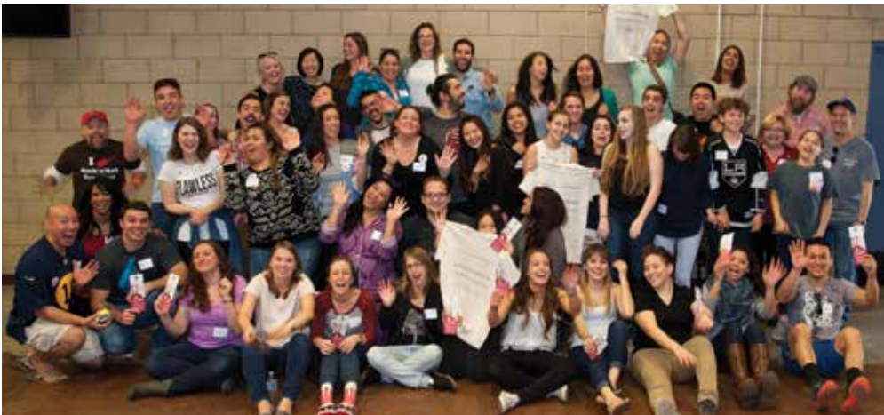
Walk for Kids Kick Off Breakfast with team members from our Counselor and WOLP teams.