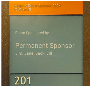
Sample Room Signage:

When your child is critically ill, your whole world can stop. Finding the right doctors or treatment plan could mean traveling across the county, state, country or even the world. Every parent should be able to focus on the health and care of their child without having to worry about where they will stay.