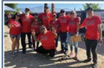
Shoot, Loot and Scoot presented by The Establishment Club