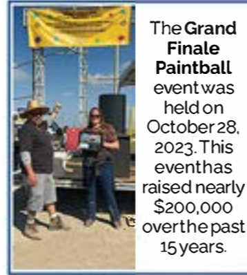
The Grand Finale Paintball event was held on October 28, 2023. This event has raised nearly $200,000 over the past 15 years.