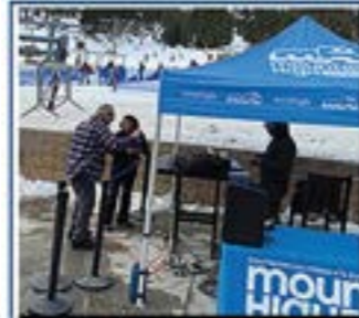
February 2023 Mountain High Ski and Ride Day