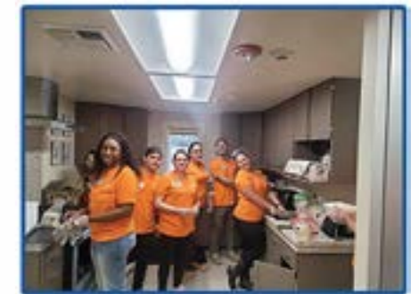
Amazon Meal of Love

The Meals of Love program at IERMH has had a fantastic 2023! The Meals of Love Program allows volunteers to come in and prepare a meal for the families staying at IERMH.