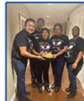
Sanchez Family Organization

San Manuel Cares showed up at IERMH ready to cook and clean for the families. You could feel all the love pouring out of them into the House. San Manuel Band of Mission Indians truly does care.