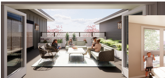
Rucker Family outdoor deck