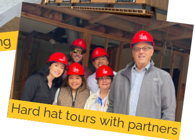
Hard hat tours with partners