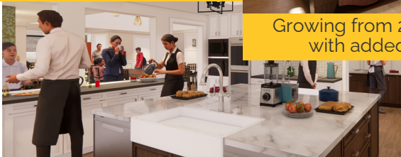
Expanded kitchen and pantry

You, your company or family can sponsor one of our rooms or common area through the annual Adopt-A-Room and help provide a place in our House for families to stay each night as their children receive the medical treatment they need.