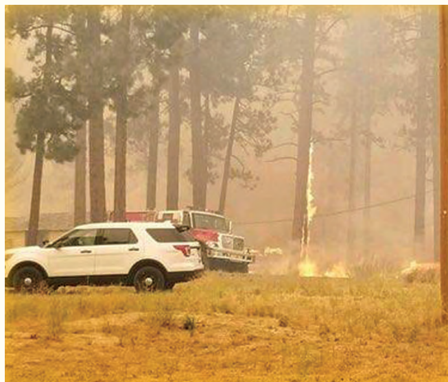
We'll come back from this setback stronger than ever, thanks to you and your generosity!

Never before has a fire come so close to destroying the place we all hold so dear. But because of YOUR support, we'll emerge from this experience stronger than ever. Thank you for making it possible.