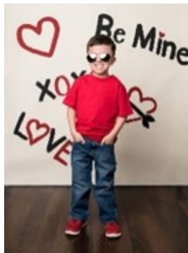
Jordan, age 7

We suggest a contribution of $10 per day from families staying at our Ronald McDonald House, but we never turn a family away if they are unable to pay. We rely on fundraising revenue to make up the balance of our operating costs. Without our program, and your continued and compassionate support, many of the deserving families would simply have no affordable choice for lodging while their children receive life-saving treatment at area