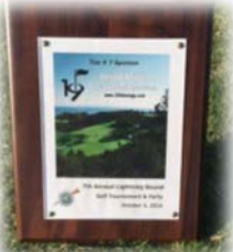
Plaque at Hole