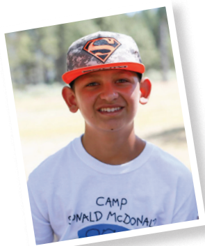
Making a positive, long-lasting impact on children with cancer & their families since 1982

Non-Profit Org. U.S. Postage PAID Los Angeles, CA Permit No. 559