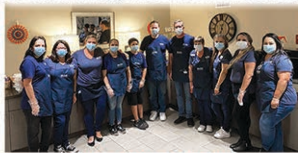
Alta Vista Meal of Love