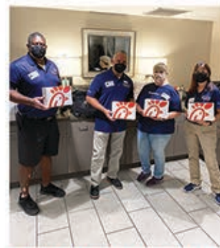
Southwest Airlines Meal of Love