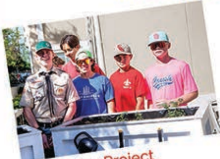
Planter Box Project

Community projects and donations really do make a difference at IERMH. Recently, Troop 19 spent several hours at IERMH to complete an Eagle Scout Project. They built a patio over the house BBQ and two planter boxes.