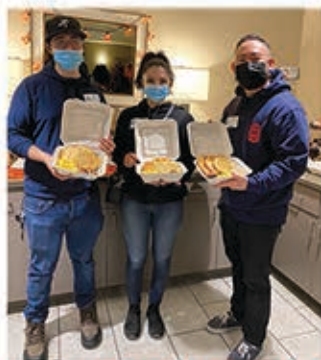
Amazon Meal of Love

Our Meals of Love program allows volunteers to give families a night off by preparing a hot meal or making one possible from a local restaurant. Families appreciate the chance to relax and enjoy a hot meal with no dishes to wash.